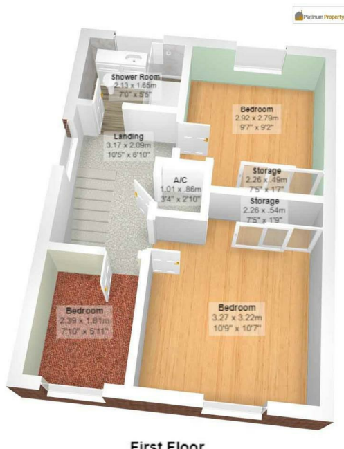
All measurements are approximate and for display purposes only