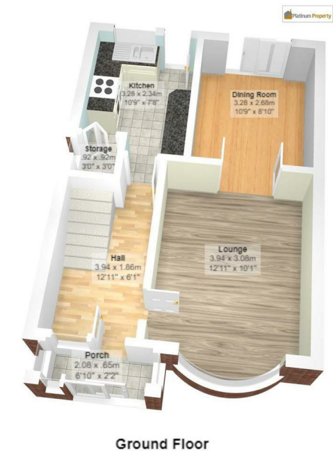
All measurements are approximate and for display purposes only